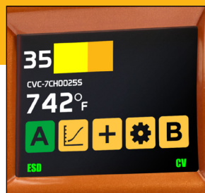
Tip temperature displayed on large color screen.