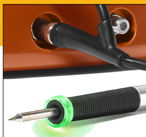
LED equipped hand piece signals to operator when a good solder joint is formed.